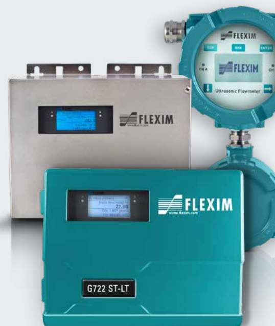
The FLUXUS® ST series is available for fixed installation and for portable use.

Two ultrasonic transducers are mounted with a defined distance onto the pipe. By sending sound signals alternating with and against the flow, a transit time difference can be measured. This corresponds to the flow velocity.