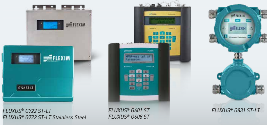
FLUXUS® G722 ST-LT FLUXUS® G722 ST-LT Stainless Steel

More than 30 years of experience in non-invasive ultrasonic flow measurement