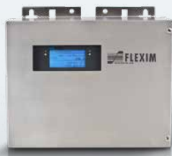
FLUXUS® G722 ST-HT Stainless Steel