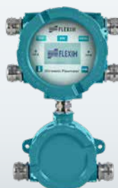
FLUXUS® G831 ST-HT