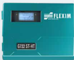
FLUXUS® G722 ST-HT

More than 30 years of experience in non-invasive ultrasonic flow measurement