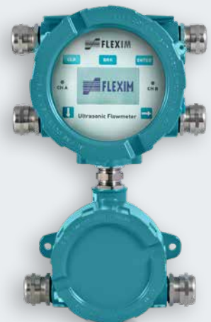
High Temperature Steam Meter G831 ST-HT for hazardous environments