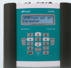
FLUXUS® G601 ST

FLEXIM GmbH, Germany Phone: +49 30 93 66 76 60 info@flexim.de