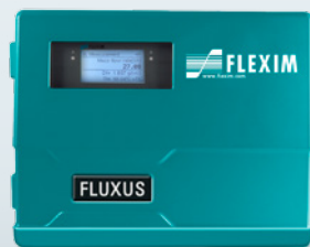
FLUXUS® G721 ST

More than 25 years of experience in non-invasive ultrasonic flow measurement