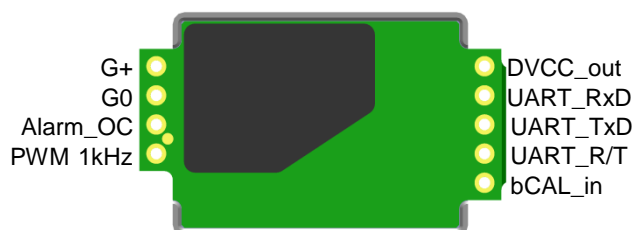
Figure 2. Pin assignment