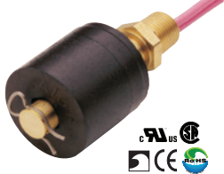
LS-1700 Series – Buna N Float