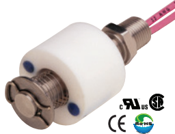
LS-1700 Series – Teflon® Float