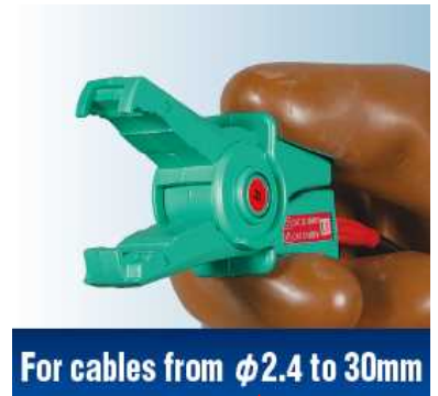
For cables from \phi 2.4 to 30mm