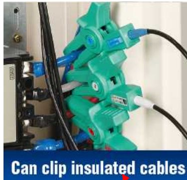
Can clip insulated cables