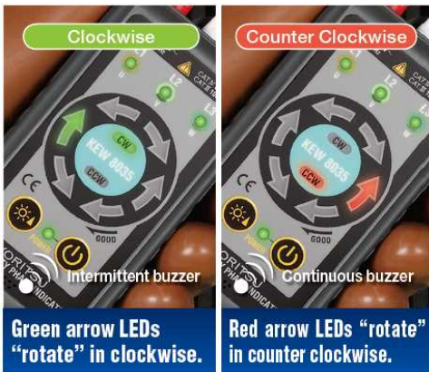
Green arrow LEDs "rotate" in clockwise.