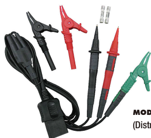
MODEL 7121B (Distribution board test leads)