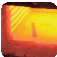
Kilns and furnaces